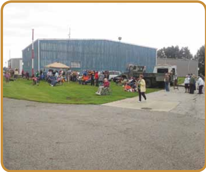
The tailgating crowd who came out to watch the skydives for OQC.