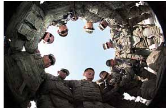
U.S. Soldiers with the 2nd Platoon, Bravo Company, 1st Battalion, 294th Infantry Regiment, Guam Army National Guard gather to say a prayer before a mission at Main Operating Base Lashkar Gab, Helmand province, Afghanistan, July 19, 2013.