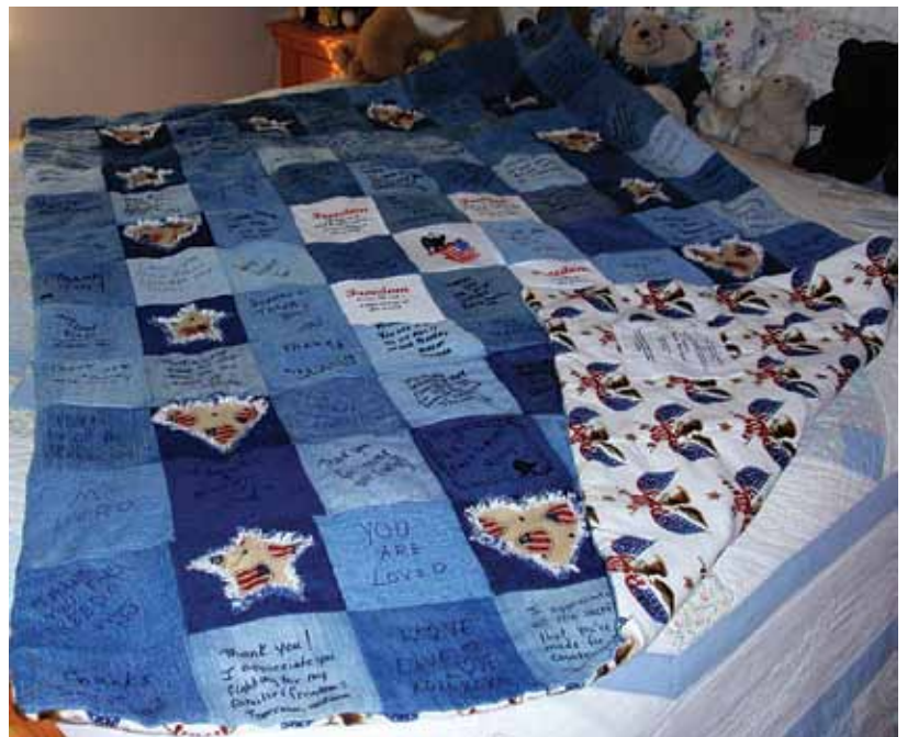
Four Freedoms Gratitude Quilt.