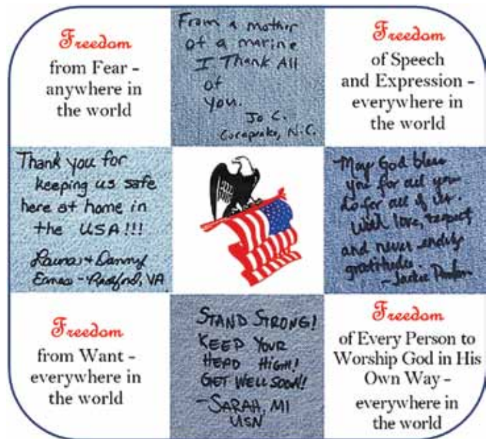
Four Freedoms Gratitude Quilt center with signed squares.

Completed quilts can be sent to: Operation: Quiet Comfort c/o The Houins 17671 13th Rd. Plymouth IN 46563